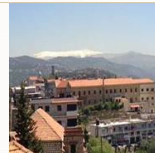
Le Crillon Hotel, Broummana